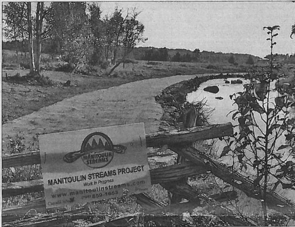
A view of the stream stabilization project carried out on the Manitou River. Root wads and boulders help to reinforce the shore.

By supporting people, communities and business through its programs and services, FedNor aims to open doors and build futures for a prosperous Northern Ontario.